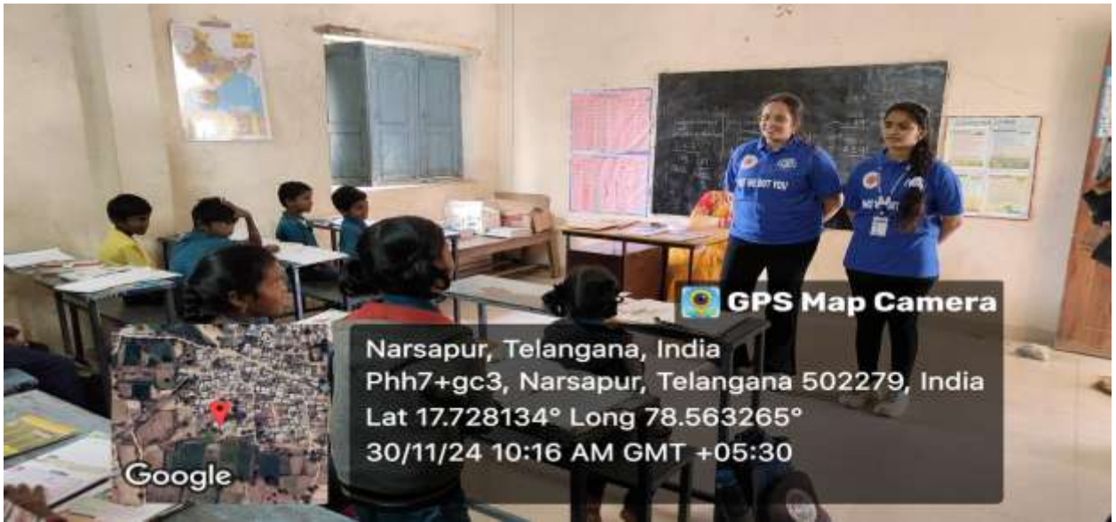
NSS volunteers interacting with students