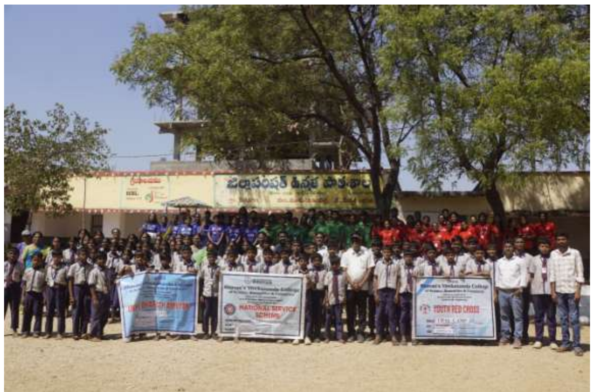
A group photo of all the three units with the students.