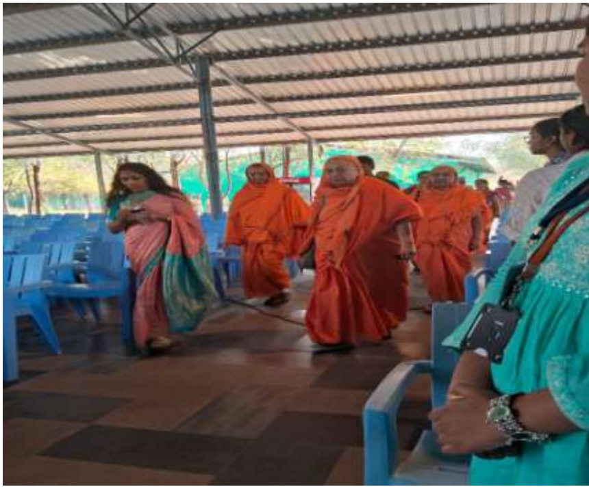
Welcoming of guests