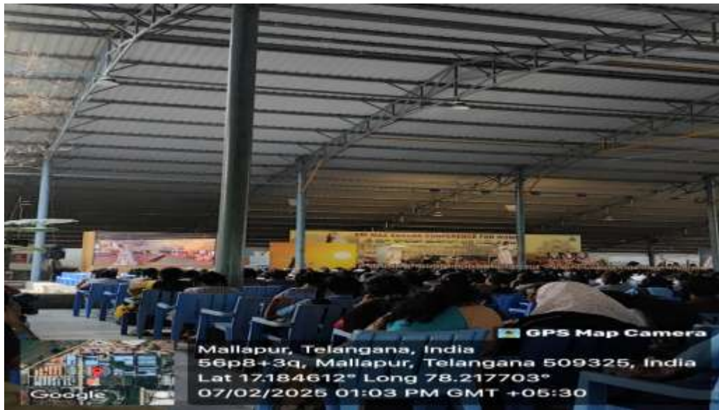
Youth Convention Hall