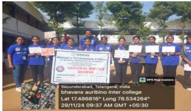
Volunteers of NSS