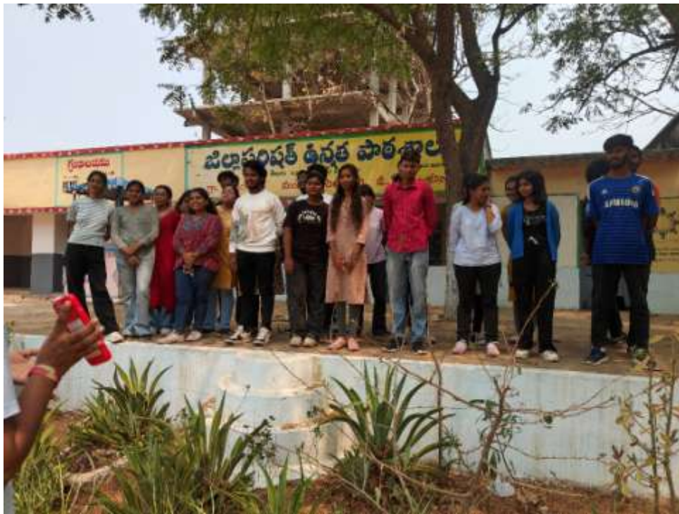
Volunteers assembled at Keshawaram Government School