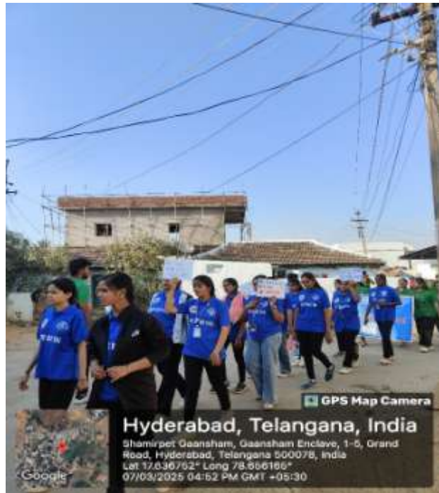
Volunteers performing rally.