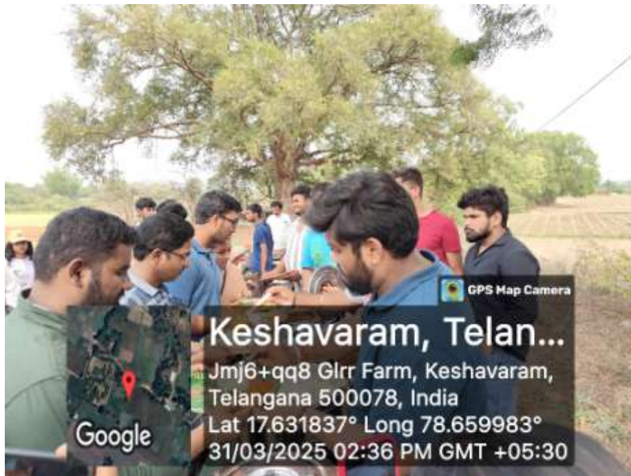
Lunch at the crop field