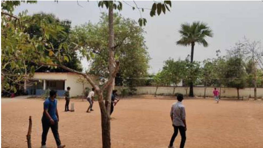
Playing games at the school