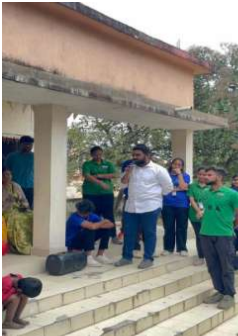
Speeches by the coordinators