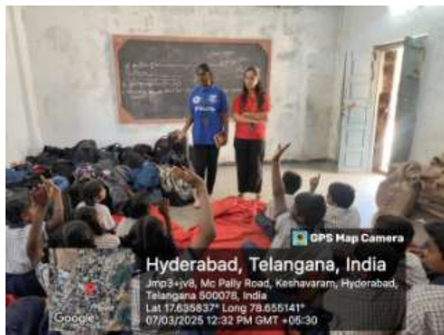
Awareness program conducted by students