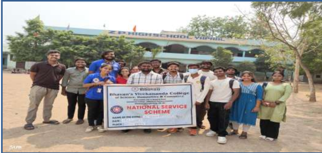
Group photo of the volunteers