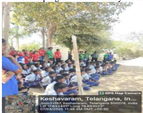
Self defence program.